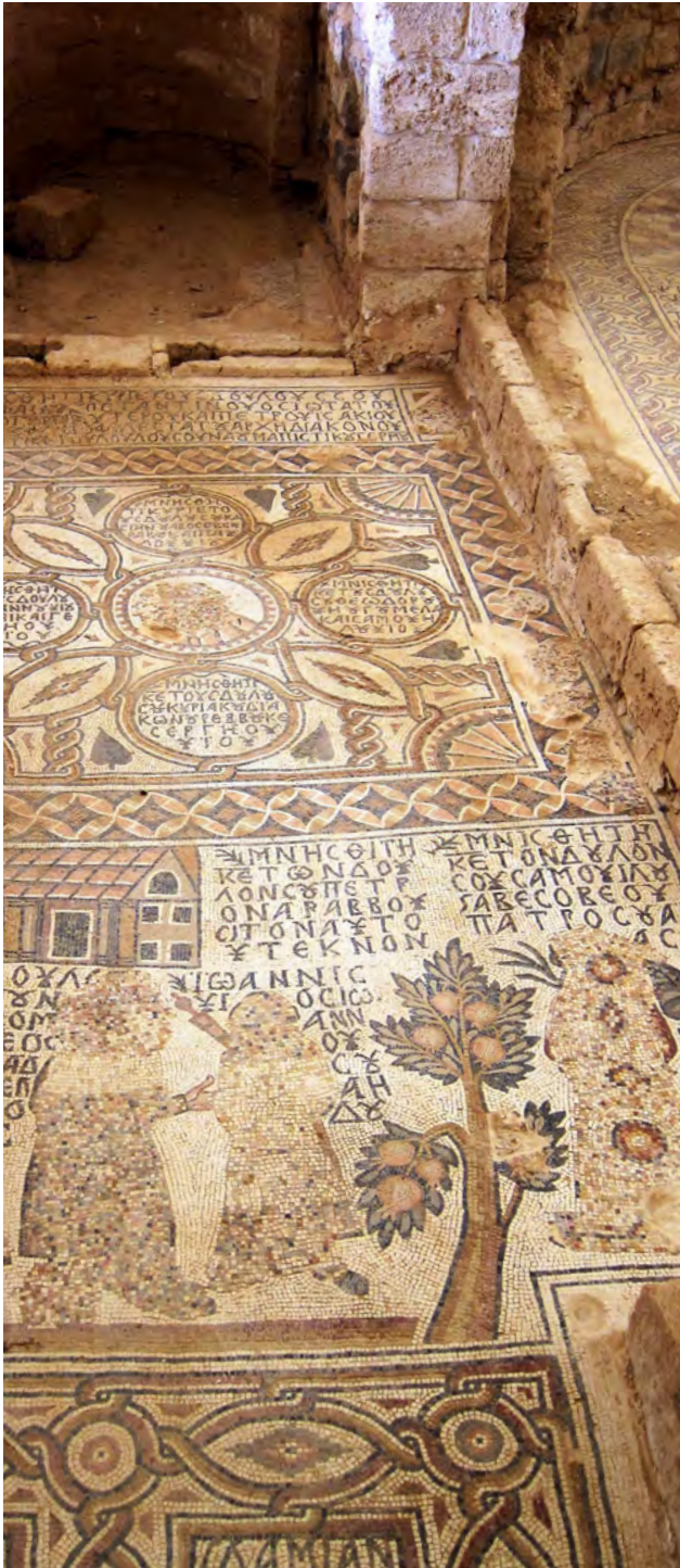
Jordan, Umm Er Rasas, St Stephen Church (detail)

The churches in Byzantine and Umayyad-era Jordan and Palestine attest to a fascinating change in visual culture in their significant alterations of mosaic pavements. The tesserae of animal and human figures were removed, shuffled, and reinserted to pixelate faces and other body parts.